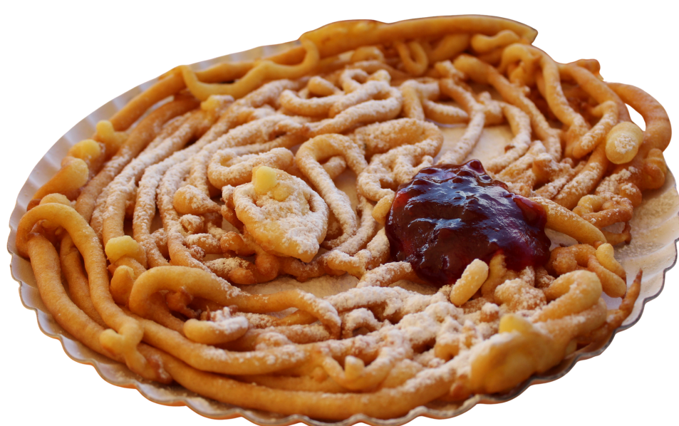
STRAUBEN CON CONFETTURA DI RIBES Aggiunta di pallina di gelato + 2€