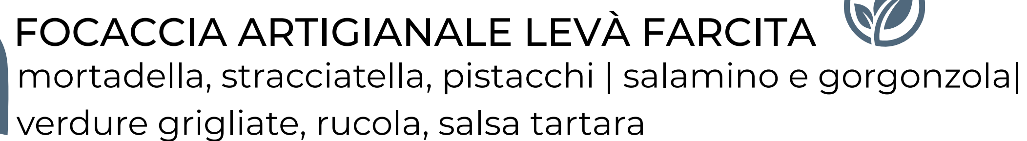
GEFÜLLTE HANDWERKLICHE FOCACCIA LEVÀ mortadella, stracciatella, pistazien | salami und gorgonzola | gegrilltes gemüse, rucola, tartarsauce