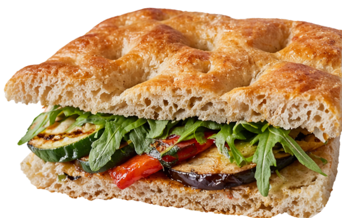
FILLED ARTISAN FOCACCIA LEVÀ mortadella, stracciatella, pistachios | salami and gorgonzola | grilled vegetables, arugula, tartar sauce