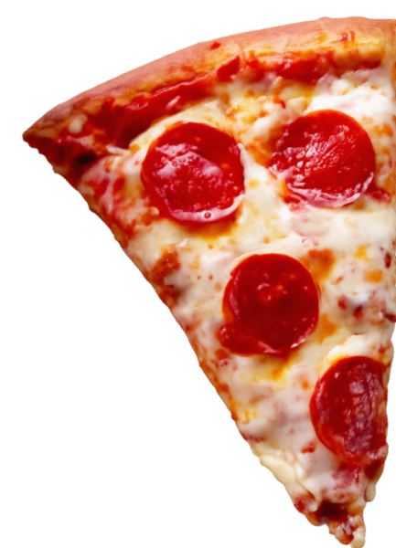
PIZZA FARCITA PIZZA MIT BELAG PIZZA WITH TOPPINGS